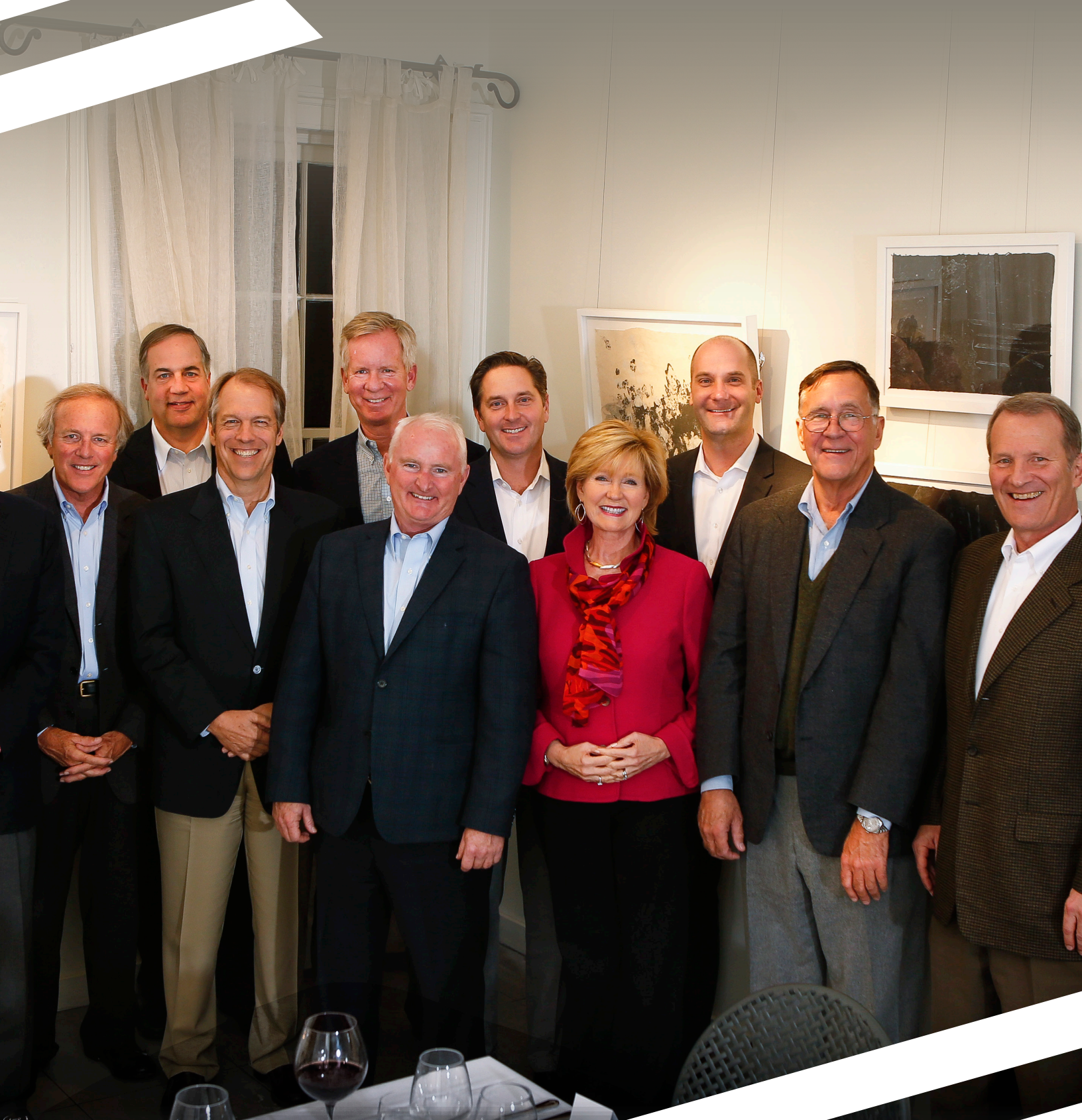
AOPA Board of Trustees